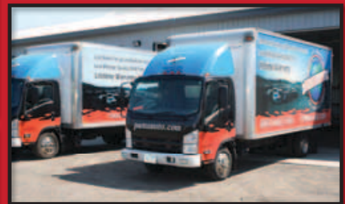
QUICK DELIVERY - Most Orders Ship Same Day

>>> Scan this QR Code with your smart phone to view a video about PAM's Auto