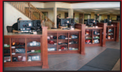
Professional Sales & Support Staff