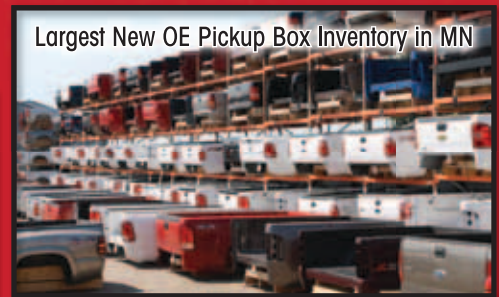
Largest New OE Pickup Box Inventory in MN